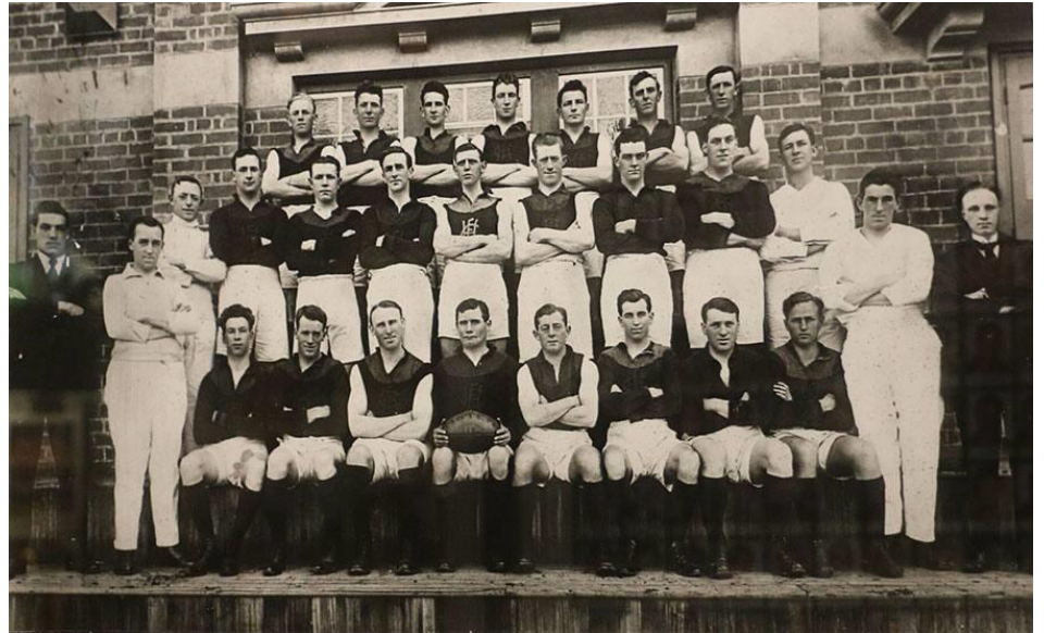
The Hawthorn Football Club in 1922.

Hawthorn played in the Metropolitan Junior Football Association (later the VAFA) between 1902 and 1913, before joining the VFA in 1914. The club began lobbying for entry to the VFL in the early 1920s and was admitted to that competition in 1925 despite modest results during its eight season VFA stint that was interrupted for three years by the Great War. Hawthorn's only final during this era was the 1923 first semi final, which it lost to Port Melbourne 14.11 (95) to 9.13 (67). Hawthorn played 140 VFA games for 57 wins, 81 losses and two draws, and in 1924, its last VFA season, it finished sixth with 10 wins and eight losses. The following year Hawthorn played its first league match against Richmond, going down by 39 points, 5.8 (38) to 11.11 (77) at a capacity Glenferrie Oval. Hawthorn finished last in their first league season. It won only three matches that year, and two of those were against fellow newcomers to the VFL, Footscray and North Melbourne.