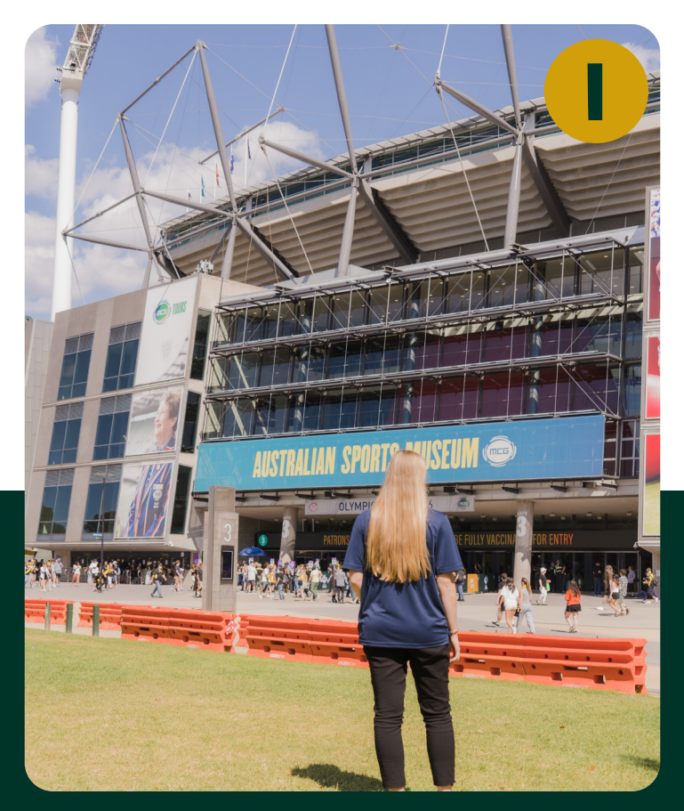
I have my ticket or membership and am going to the MCG to watch the footy.